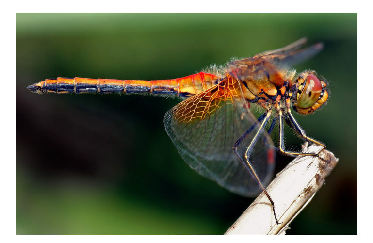
A dragonfly is an example of an insect