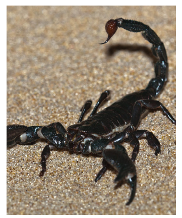
This spider is an example of an arachnid.