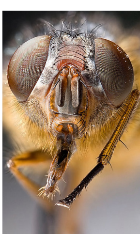
Above: Ladybugs are actually beetles Left: An insect's compound eyes