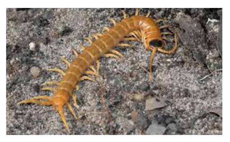
This centipede is an example of a myriapod.

This spider is an example of an arachnid. The diagram shows its two body parts, or segments: the cephalothorax and the abdomen.