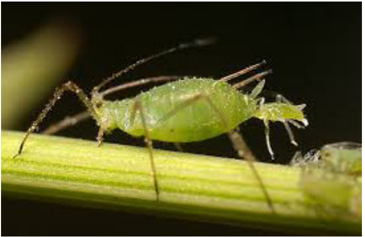
The sap-sucking aphid is an example of a true bug

Insects include beetles, ants, mosquitoes, dragonflies, butterflies, bees, grasshoppers and may more! There have been about 900,000 species of insects identified, with potentially as many more yet to be identified. Insects represent approximately 80% of all the world's species of living things.