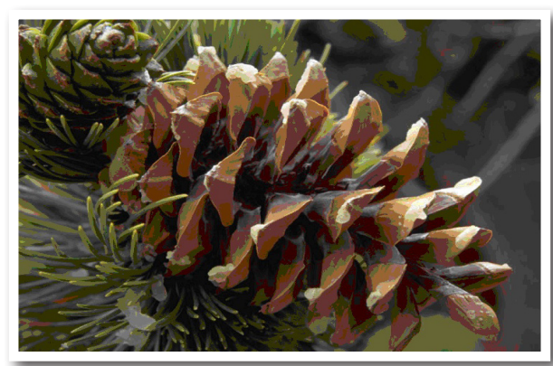
Limber pine cone.

Limber pine offer a vast array of ecological functions, and are an important keystone species. Limber pine seeds are very nutritious and are an important food source for several species of wildlife such as; black and grizzly bears, squirrels, small rodents and the Clark's nutcracker (Nucifraga columbiana). The Clark's nutcracker is one of the main seed dispersers for the limber pine tree. Unlike the limber pine's close cousin the whitebark pine (Pinus albicaulis), it does not solely rely on the Clark's nutcracker for seed dispersal.