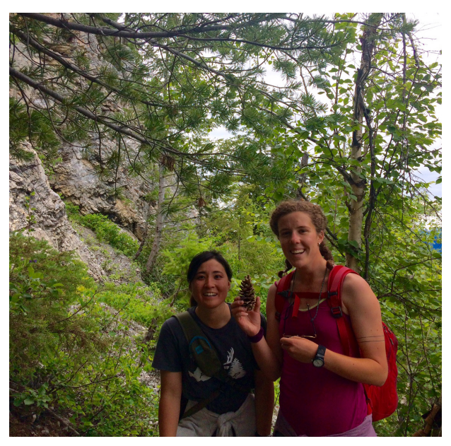
Volunteers discovering limber pine on Mount Kapristo.

This project is addressing the health and distribution of limber pine (Pinus flexilis) in the Golden area. Limber pine are listed as endangered under the federal Species at Risk Act (SARA) and the Committee of the Status of Endangered Wildlife in Canada (COSEWIC) as of November 2014. This tree is classified as a red listed species provincially. There are several factors that are attributing to the decline of limber pine populations. The main factor attributing to the decline is white pine blister rust (Cronartium ribicola) which is an introduced pathogen and an airborne fungus. White pine blister rust has currently infected a large portion of the limber pine populations in British Columbia. Other contributing factors are mountain pine beetle (Dendroctonus ponderosae), climate change, fire exclusion and habitat loss.