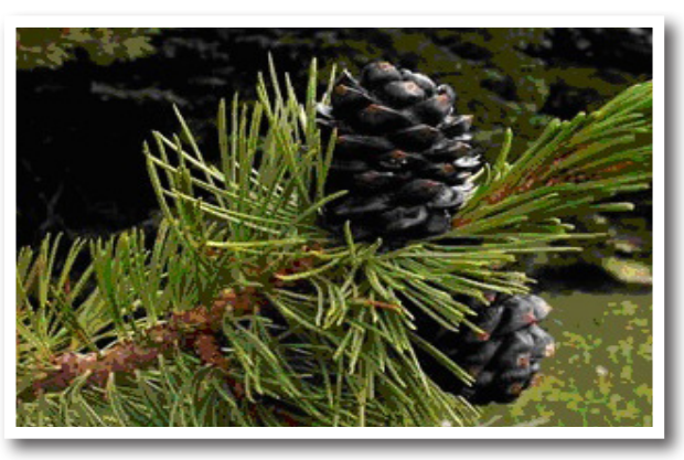
Whitebark pine cone.