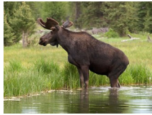
MOOSE-ms Alces alces