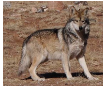
WOLF-wf Canis lupus