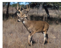
MULE DEER- md