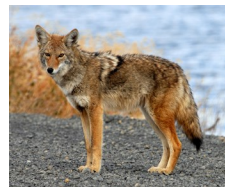
COYOTE-cy Canis latrans