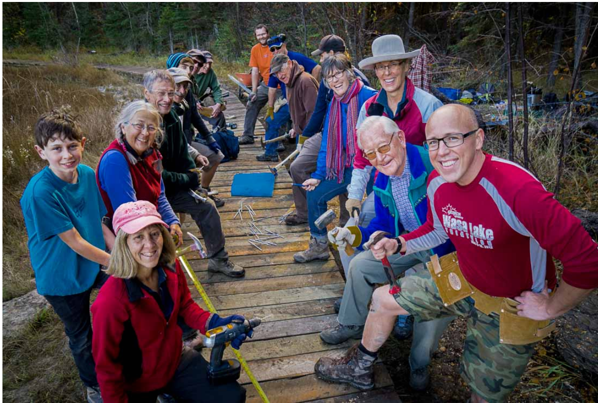
Volunteers built a boardwalk access for nature-lovers while reclaiming a Lake Enid marsh that was destroyed by ATVs.