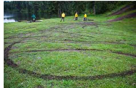
A collaborative cleanup and responsible use campaign at Lake Enid led by Wildsight and the Windermere Valley Dirt Riders.