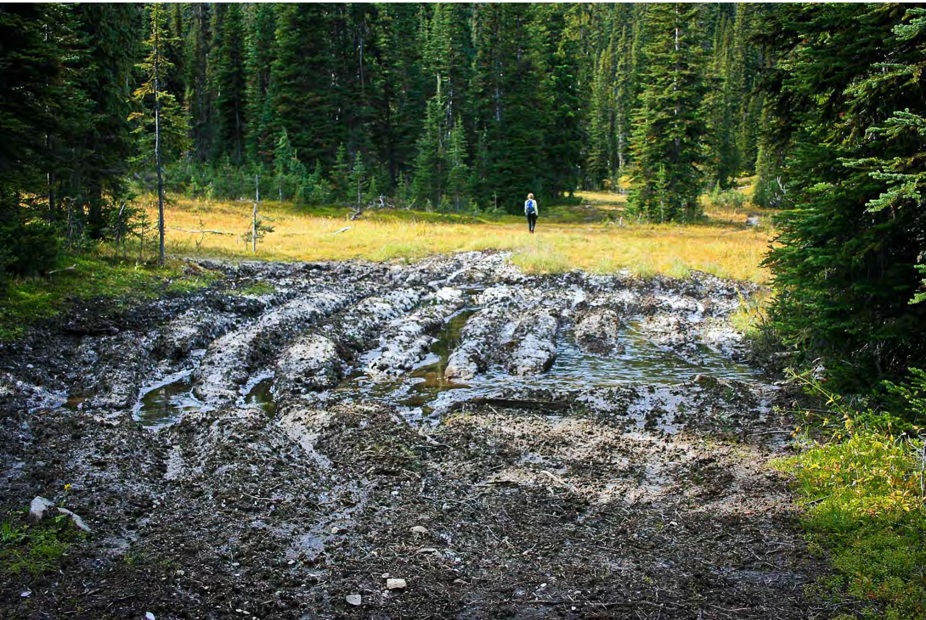
A trashed sub alpine marsh in northern Purcells.