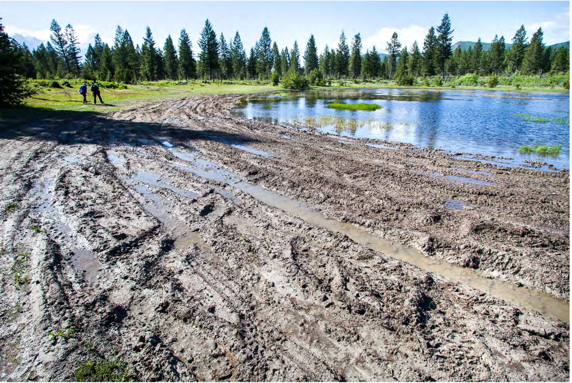
Shoreline at Rushmere trashed by ATVs, 100 m from a BC Forestry sign that prohibits motorized use in environmentally sensitive areas.