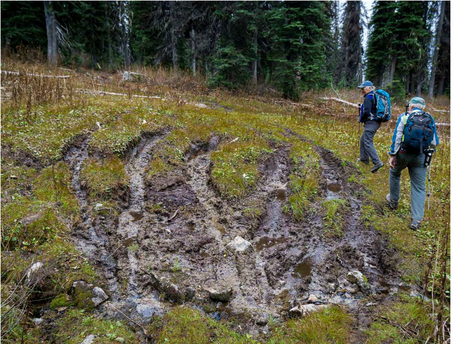
ATV carnage on Haiseldean Lake recreational trail, upper Redfish Creek.