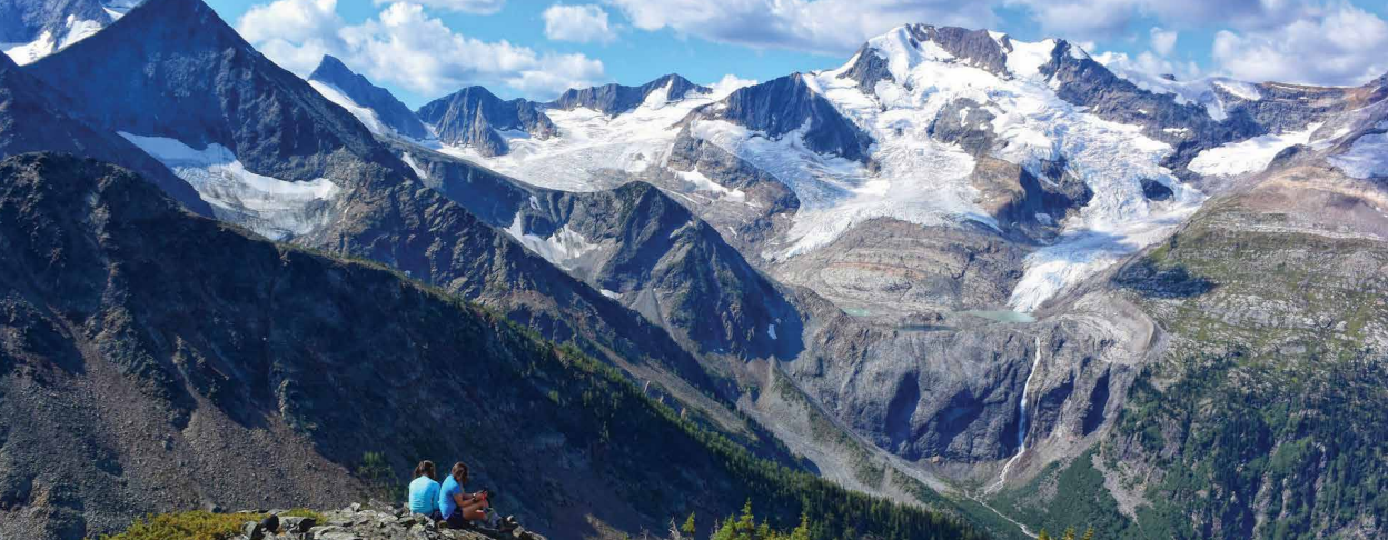
Go Wild students at Earl Grey Pass, Photos: Dave Quinn